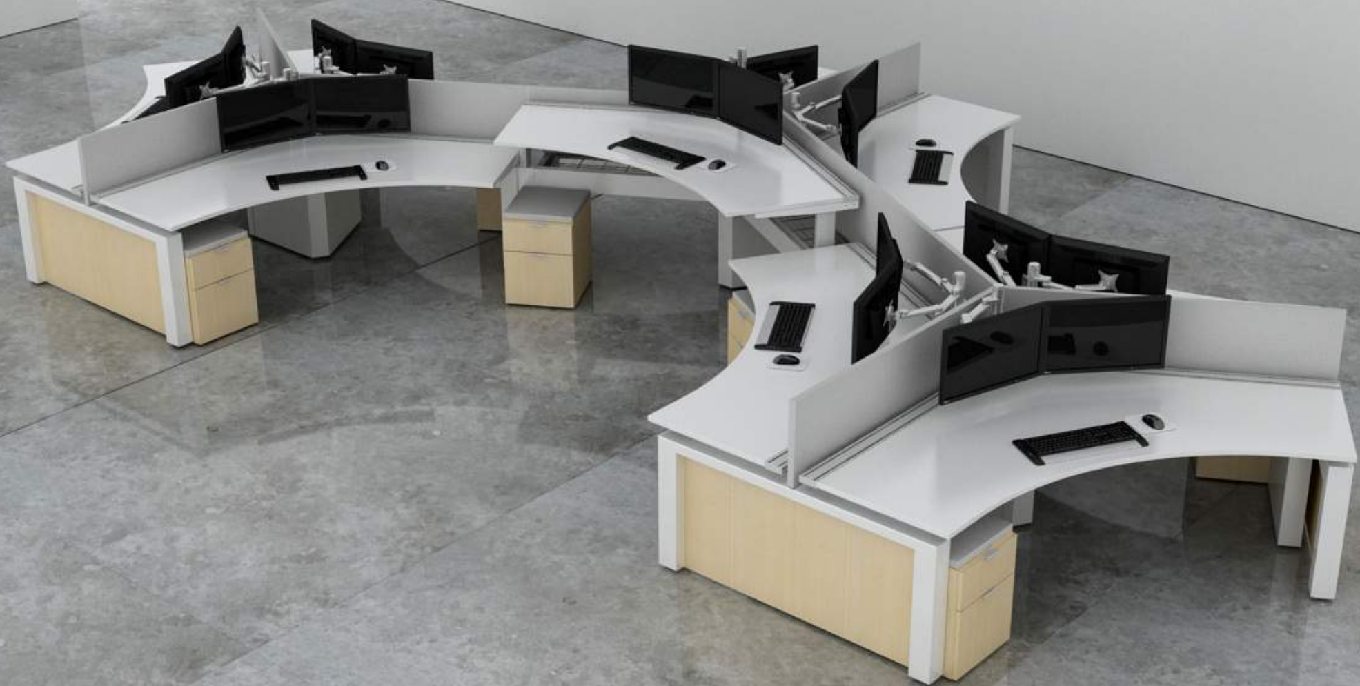
120° Configuration 14 | Innovant, Inc.